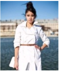
White Takes Over As The New Neutral