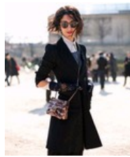
Ooh La La: Paris Street Style Part Deux