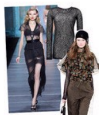
Pull Off A Sheer Top Without Baring It All